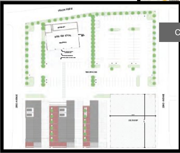
Campus Site Plan